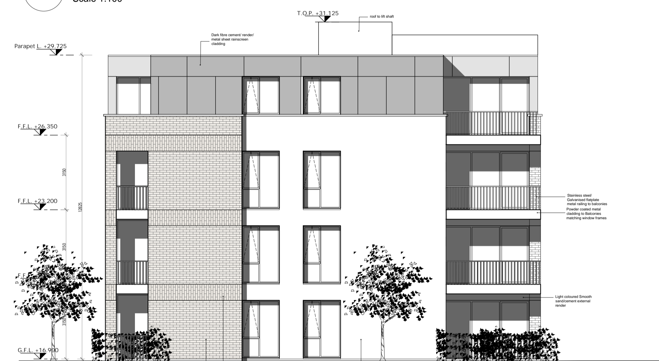
04 Eastern Elevation Scale 1:100