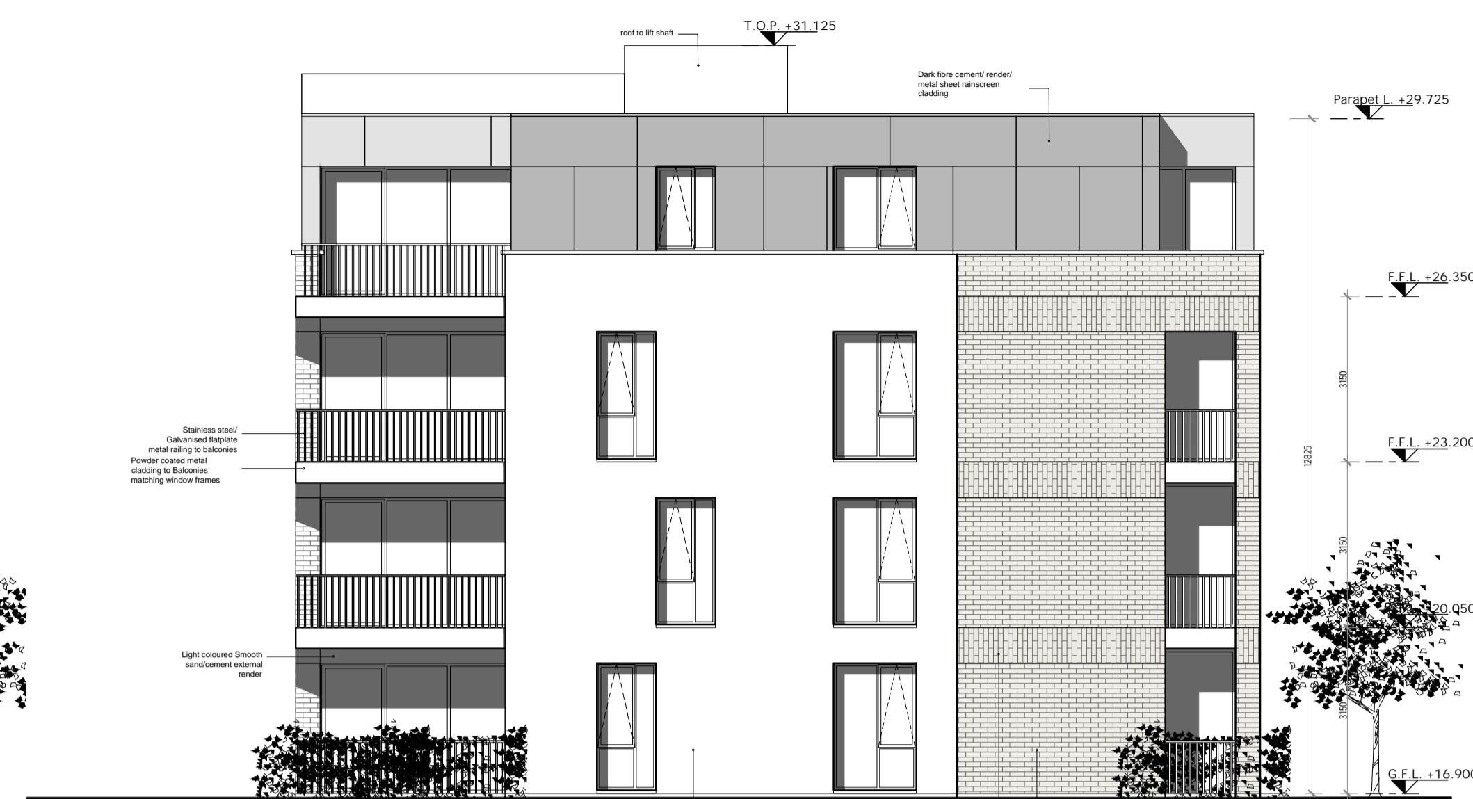
03 Western Elevation Scale 1:100