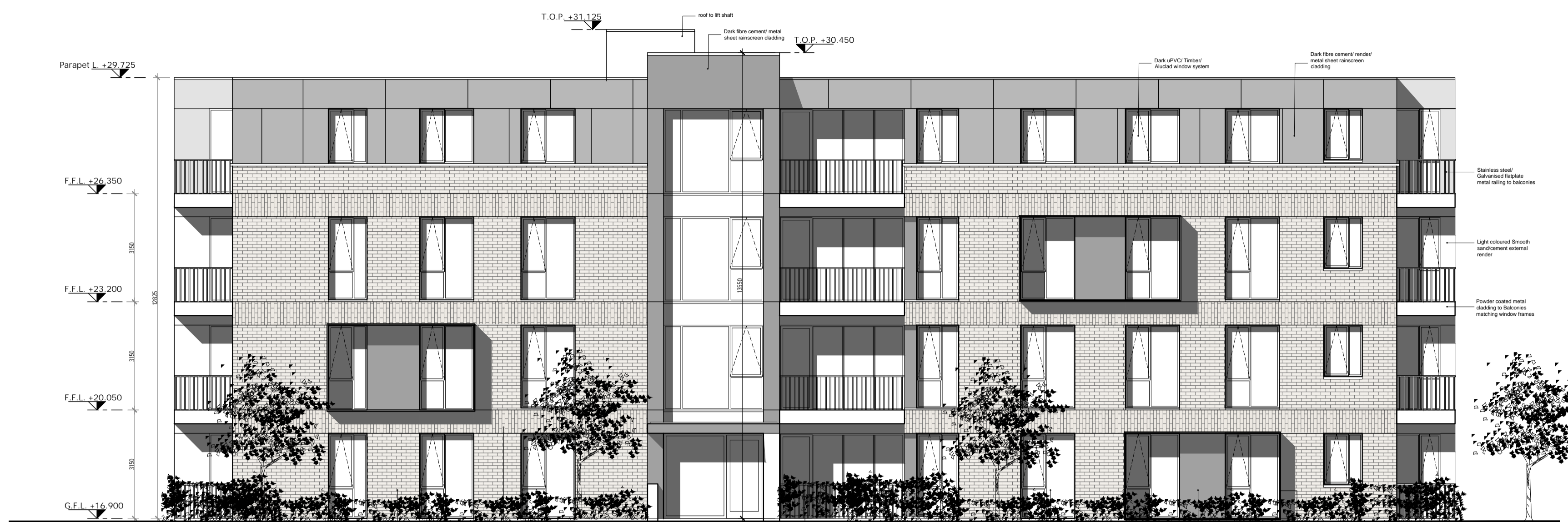
01 Northern Elevation Scale 1:100